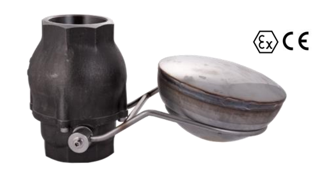
NF EN 13616

12 months provided fitting and operating instructions are observed.